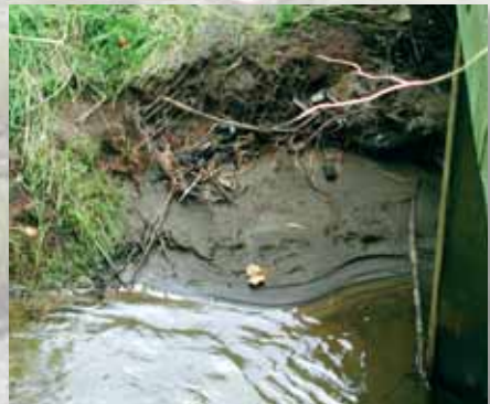
These raccoon tracks are a tell tale sign that more than people find this section of the river valuable for its numerous river access points.