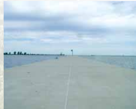
Where the river meets the lake...on the left side of the break wall is the Grand River, and on the other is Lake Erie.

Monstrous shadows are cast upon the water of the Grand as we move along. Gigantic piles of sand and gravel create the feeling of traveling through a mountain chain. Here at Fairport Harbor, Lake County's largest and most commercially active port the Grand River reaches the end of its hundred mile journey. The river tranquilly meets the lake, pouring the cleanest water into the lake, and sending water that fell on farm fields in Parkman, forests in Rome Township, vineyards in Madison, and rooftops in Painesville on an international journey into and out of Lake Erie and over Niagara Falls. We all live downstream, and what we do on our land in the Grand River Watershed ultimately determines the fate of the river, Lake Erie, and beyond.