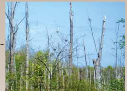
This great blue heron rookery, or nesting site, is located within the Grand River Lowlands, a high priority conservation area. These large, 3 foot-tall, stork-like birds will use dead standing timber to construct their massive nests over expanses of open water.