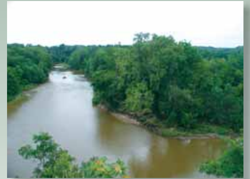
A view of the Grand River from high above. This property is newly owned by Lake Metroparks

to conserve property and still allow it to be maintained in private hands. However, in this lower stretch of river Grand River Partners, Inc. feels it is important to offer the large number of people living in close proximity to the river, greater access to it. It is Grand River Partners, Inc. primary goal to work with our partners to secure land for public access, giving people greater opportunities to enjoy the river in this urbanized area.