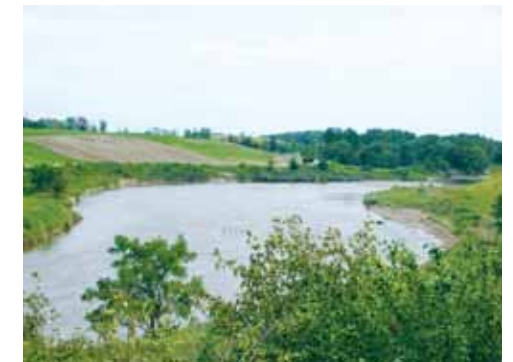
Here we can see one of the trademarks of the Estuarine Area of the Grand River Watershed...a wide floodplain.