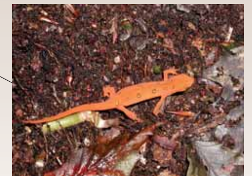
The red spotted newt, found throughout the Grand River Watershed, is a colorful specie that requires a pollutant free, mature forest to thrive.