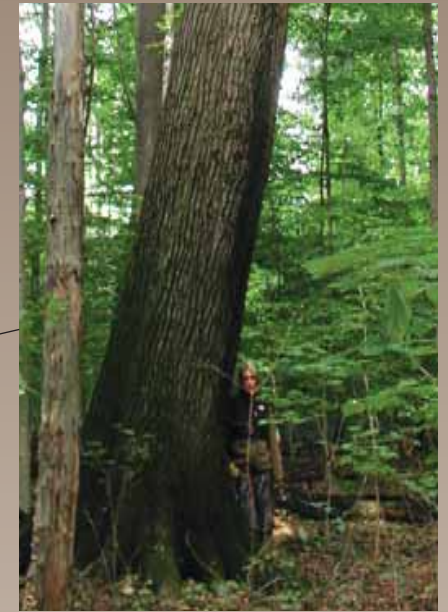
A major boom in the timber industry and conversion of forest into farmland was responsible for reducing Ohio's woodlands to a historic low of only 10% by 1940. Today it is difficult to find giant trees like this Grand River oak, in Ohio.